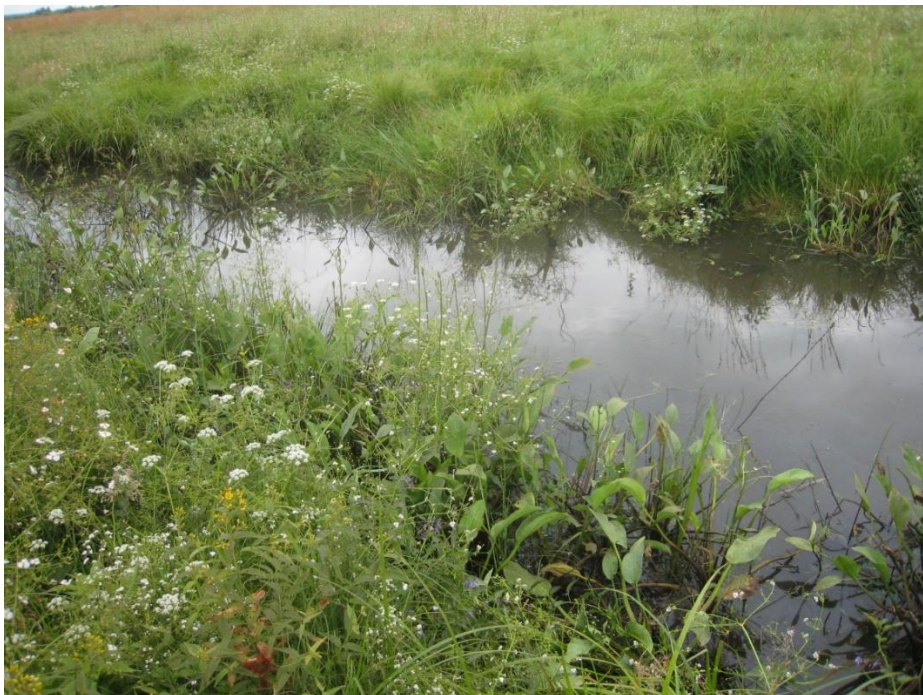
Fig. 2. Photograph of the sampling site

The algal samples were collected in July 2018, at water temperature of 23.5 °C, pH 7.1–7.3, conductivity 59-60 µS. Figure 2 shows the sampling location.