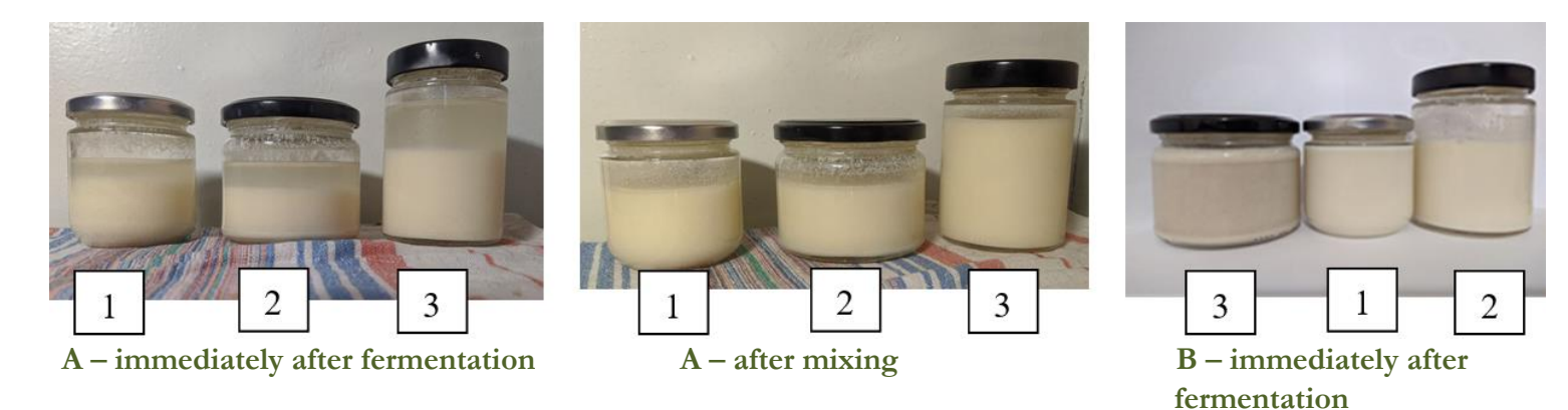
Fig. 1. Samples of fermented chickpea-flax drink fermented with sourdough A – "Probio yogurt" (Vivo) and B – "Vegan yogurt" (Vivo): 1 – with sugar; 2 – with additives; 3 – without additives